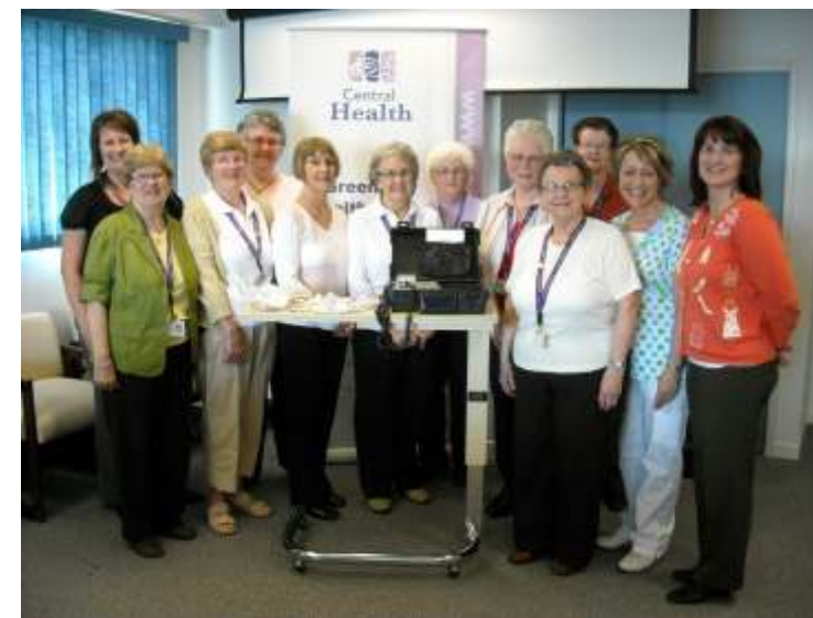
Members of the Green Bay Health Centre Auxiliary with the Rhythm Simulator they purchased for the facility.