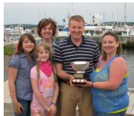
The Woolfrey Family Scotiabank Cup Winners